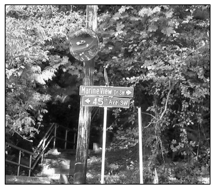
The mirror at 45th & Roxbury enables drivers to see who's coming. Other options for this location are being explored.

ACCESS: FCA contributed $2,000 toward fabrication of two pairs of handrails installed in March at steps leading up to the main entrance of the Fauntleroy Schoolhouse Community Center, greatly improving safe access to the building.