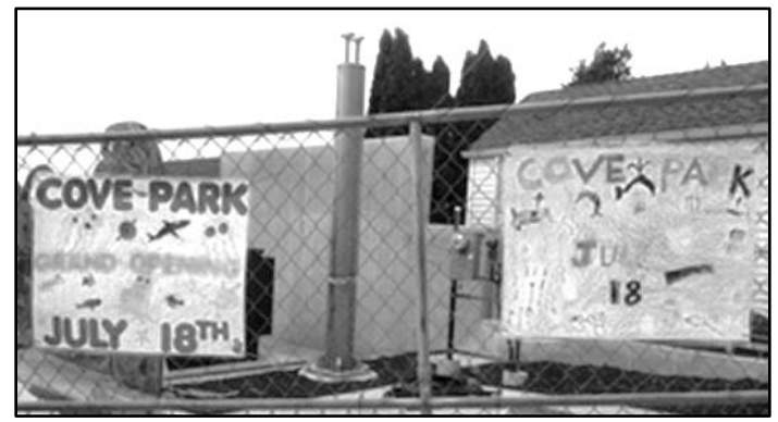
Posters made by youngsters at the Fauntleroy Children's Center invited residents to the celebration.

COVE PARK: Cove Park reopened in July after three years of construction to upgrade and expand the Barton Street Pump Station under the street-end park. Fauntleroy volunteers worked with King County Wastewater to enhance the park with more art by Tom Jay and landscaping to make it an inviting beachfront space next to the ferry terminal.