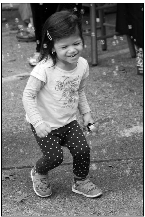
Dancing with bubbles at the Fauntleroy Fall Festival.