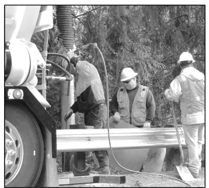
Workers installed more safety guardrail along Marine View Drive SW as a result of FCA and resident advocacy.

PUBLIC SAFETY: The FCA Board provided timely feedback to the Seattle Police Department on its draft community policing plan for the neighborhood. A representative of the Southwest Precinct regularly participates in FCA's monthly business meetings.