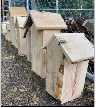
'HAPPY CITY BIRDS'

Since 2006, artist Thomas Dambo has installed more than 3,500 brightly painted birdhouses in cities around the world to call attention to responsible stewardship. Building the troll in Lincoln Park included making more.