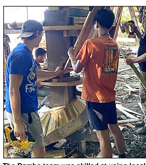
The Dambo team was skilled at using local volunteers to help bring the troll to life.