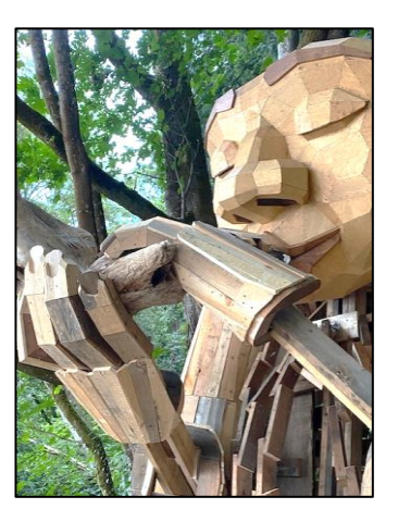
Fingers fashioned from pallet slats play the driftwood flute.