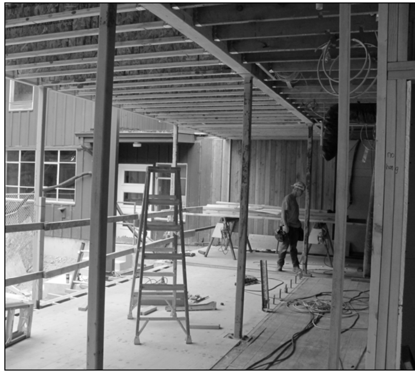
Extension of the church office to the east will gain 10 more feet for staff. (The YMCA wing is in the background.) An enlarged narthex (sanctuary lobby) below the office, with a patio, will be open to the view into Fauntleroy Park.

If you frequent Fauntleroy Church and/or the Fauntleroy YMCA, you are keenly aware that a lot of construction has been going on. Rest assured: The end is in sight.