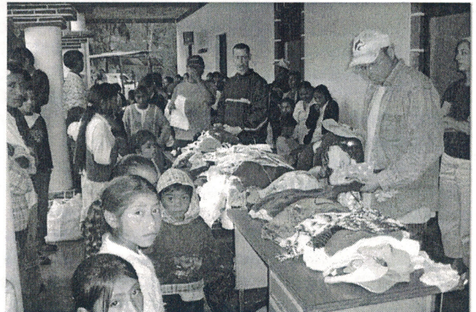
Clothing is distributed to townspeople