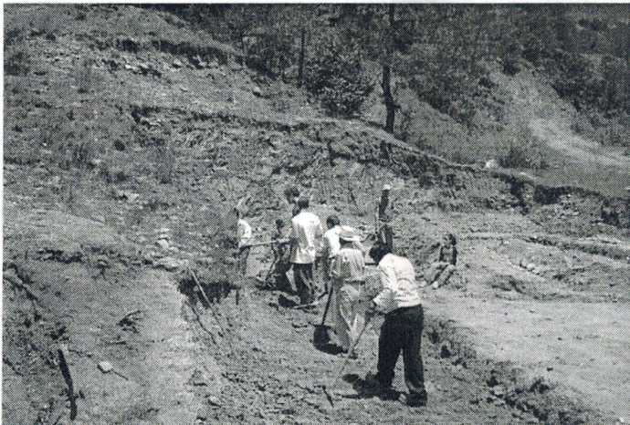
Volunteers dig to lay foundation for new church