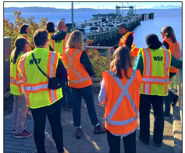
State planners working to replace the Fauntleroy Ferry Terminal got advisory-group members on site to witness operations during a typically busy afternoon commute. They also checked out Fauntleroy Creek and other environmental features.

After a year-long hiatus, planners reconvened the project's community advisory group in October, which includes advocates for this and other West Seattle neighborhoods affected by the ferry terminal, plus Fauntleroy Creek and cove. The state presented several design options that would enlarge the terminal to increase parking on the trestle. In the fall, state planners hosted a walkaround so advisers could better understand commute challenges and how an elevated and enlarged trestle might fit into the cove.