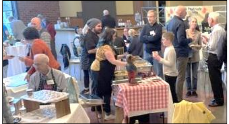
FCA hosted a full house for the FCA Annual Meeting and Food Fest. Most FCA officers and board members were able to be present to chat with fellow residents.

Residents gathered on March 21 for an all-ages evening to reconnect with neighbors and browse information tables while sampling savories and sweets provided by local eateries. Members gave FCA officers and board members a hearty thanks and another term.