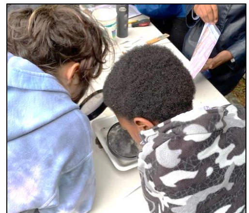
Community volunteers made research along Fautleroy Creek possible for students, including Louisa Boren STEM K-8 fourth graders checking for aquatic insects.

A self-guided nature walk coordinated by Lindsey Conrad now links visitors by QR code to online descriptions of a dozen native trees and shrubs they can find in Fautleroy Park. The watershed council also began work on a digital wayfinding project to help visitors find their way around the park and see more of its features.