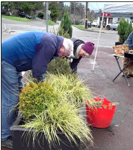
Volunteers weeded planter boxes and put in bulbs for spring color.

COMMUNITY SURVEY: This year, we invited more than 3,000 area residents to sound off about what needs FCA's attention. Findings of prior surveys have informed FCA priorities and this one will start doing the same in early 2024.